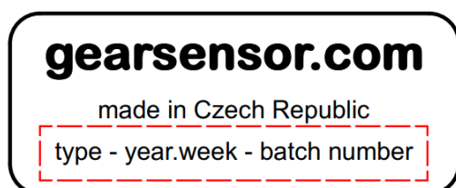
laser marking description